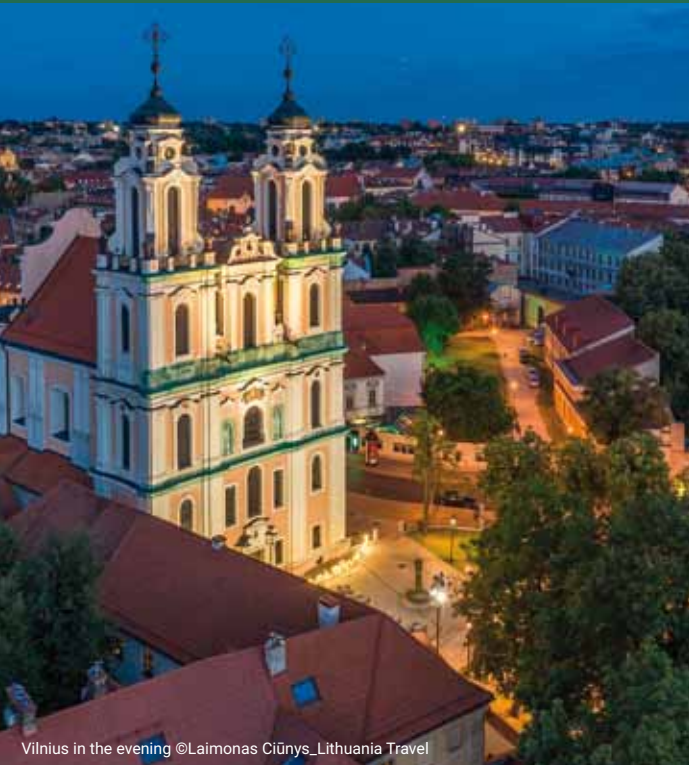
Vilnius in the evening